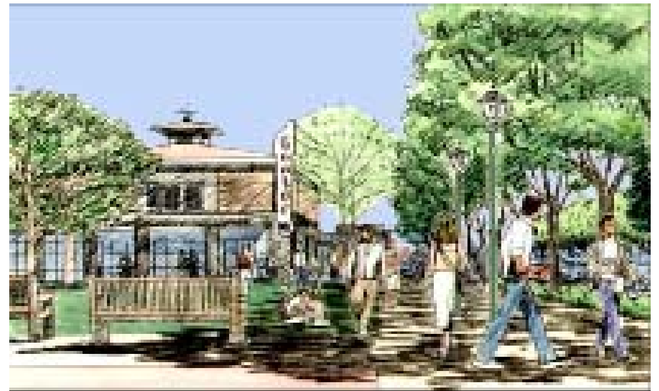
Artistic rendering from Fair Oaks Boulevard CAC presentation - Race Studio

Community Council. The Board of Supervisors will be asked to begin environmental review of the Corridor Plan in January 2009. The environmental review process is expected to take a year to complete. With any luck, the Board of Supervisors will approve the final Fair Oaks Boulevard Corridor Plan in 2010. With the completion of the planning process and a final plan, Carmichael's long-term vision for Fair Oaks Boulevard may with time become a reality. Until then a small group of neighbors and friends will continue to do their part. Early one-weekend morning every few months they will put on their work gloves and head out to clean the trash off our main street. The next clean up day is expect to occur this coming April. Can we count on you to help?